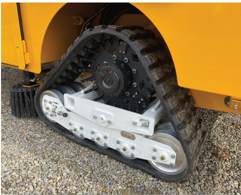
COE TRAX track drive