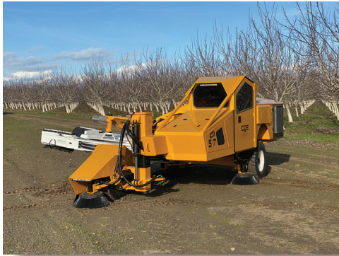
AXIOM hydraulic lift